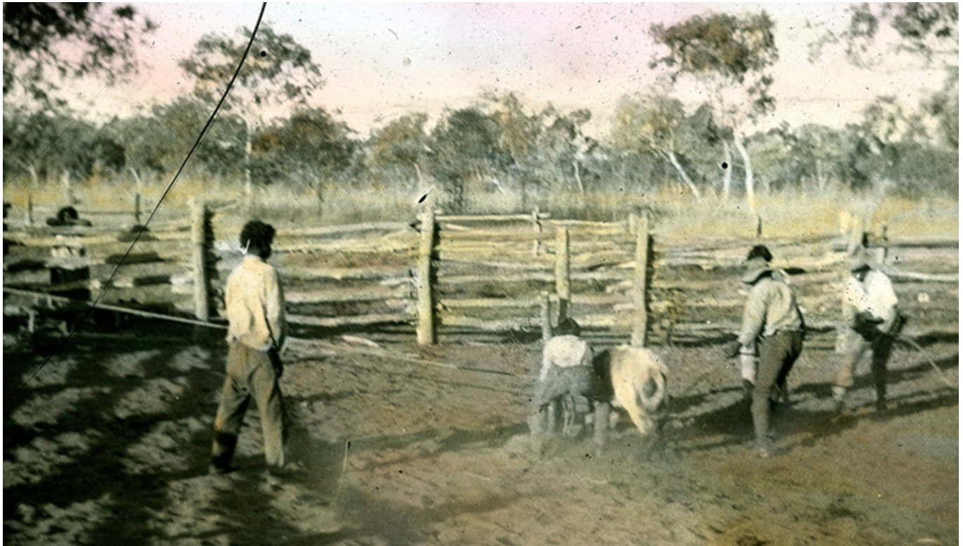
Men wrangling a calf in a stockyard Central Australia, 1930s