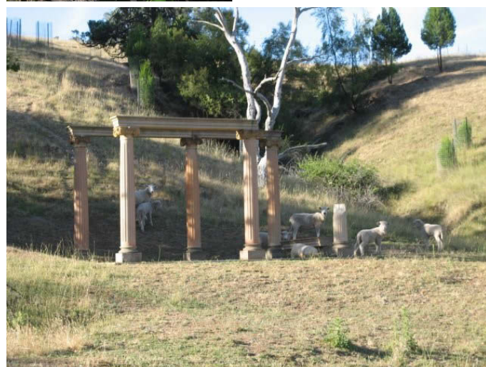
Above: The Folly